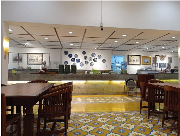
Figure 3. Interior of the Ikan Bakar Cianjur Restaurant, Malang City

Furniture is an element that cannot be separated from its presence in the world of interior design. Without furniture, space cannot facilitate its use activities optimally according to the reason or purpose for which the space was created. According to Rika (in Hadiansyah, 2016) many restaurants carry the same dining menu concept, so one way to differentiate the uniqueness of each restaurant is through a space theme that has a different identity and characteristics. The thematic carried through interior elements must be able to support the style in the interior design (Hadiansyah, 2020:43).