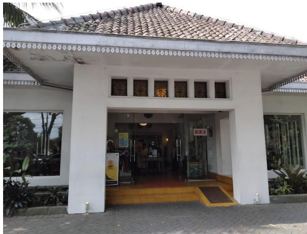
Figure 1. Front view of the Ikan Bakar Cianjur Restaurant, Malang City

The characteristics of Indische Empire Style buildings include a completely symmetrical floor plan, in the middle there is a central room which consists of the main bedroom and other bedrooms. The central room is directly connected to the front and back terraces. The terrace is usually very wide and at the end there is a row of columns in the Greek style (doric, Ionic and Corinthian).